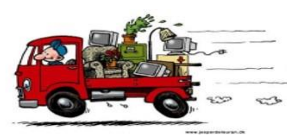
Haul Day - Need Volunteers June 10<sup>th</sup>!

The Summer Fair is fast approaching and we need volunteers for Haul Day, Saturday, June 10th. We start at 8:30 AM and are usually done by 1:00 PM. This is a great opportunity for some of our younger members to volunteer who may not have the time for other long term commitments. This is a one and done commitment that helps make our Summer Fair the success it has always been. Our older members who volunteer every year for this are also welcome and I will be in touch.