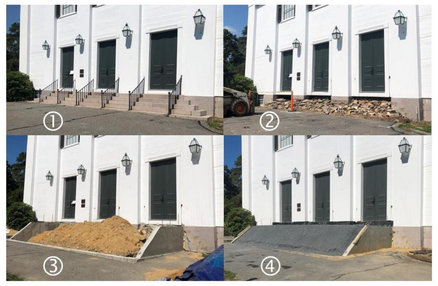
Front Step Work, July/August 2022

As you can see from the photos, the front step project has been moving forward over the summer. The old steps have been removed and the underlying structure has been put in place for the new steps. Concrete will be poured next, and then the granite will be installed (along with the new railings).